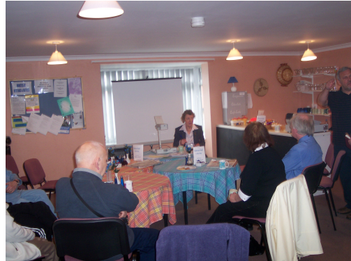
Above: Images from the CHI (Commission for Health Improvement) workshops held across county in February 2004